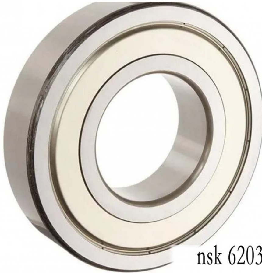
nsk 6203z bearing