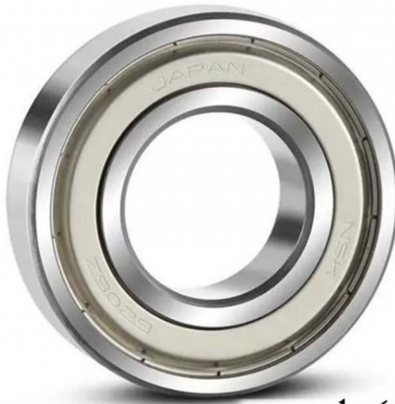
nsk 6203z bearing